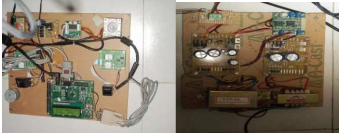
Fig 2 :ControllerDisplay Fig 3 : Other HardwareComponents

A dc motor is used to show the working of the engine. Here to start the engine the person will have to go through another fingerprint test, if it matches with the already stored, then the engine is ready to start. Once the engine starts moving it will start displaying the amount of fuel on the LCD at the car dashboard. To display the amount of fuel, a fuel level sensor is fitted in the oil tank. A float sensor is kept in the oil tank to indicate the level of oil in the engine. The level of oil in the engine is visible to the user at the dashboard. An ADC is used to convert the analog signals to digital and display on the display.